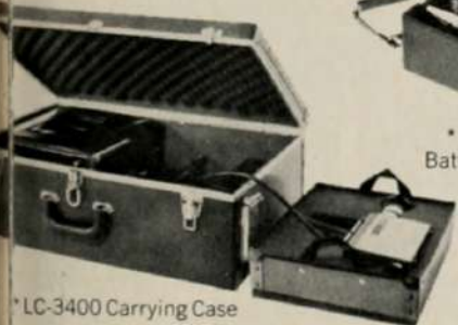
*LC-3400 Carrying Case