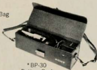
*BP-30 Battery Pack