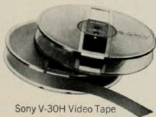
Sony V-30H Video Tape