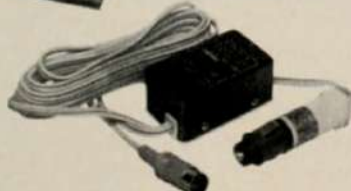
*DCC-2400 Car Battery Cord